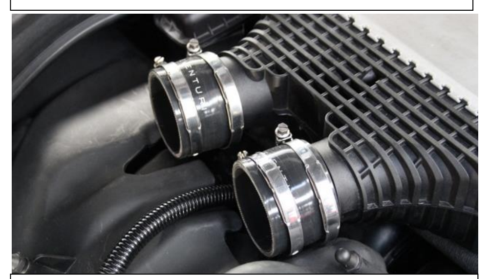
11. Push the larger silicons onto the charge cooler with the larger hose clamps. Tighten the clamps around the cooler.