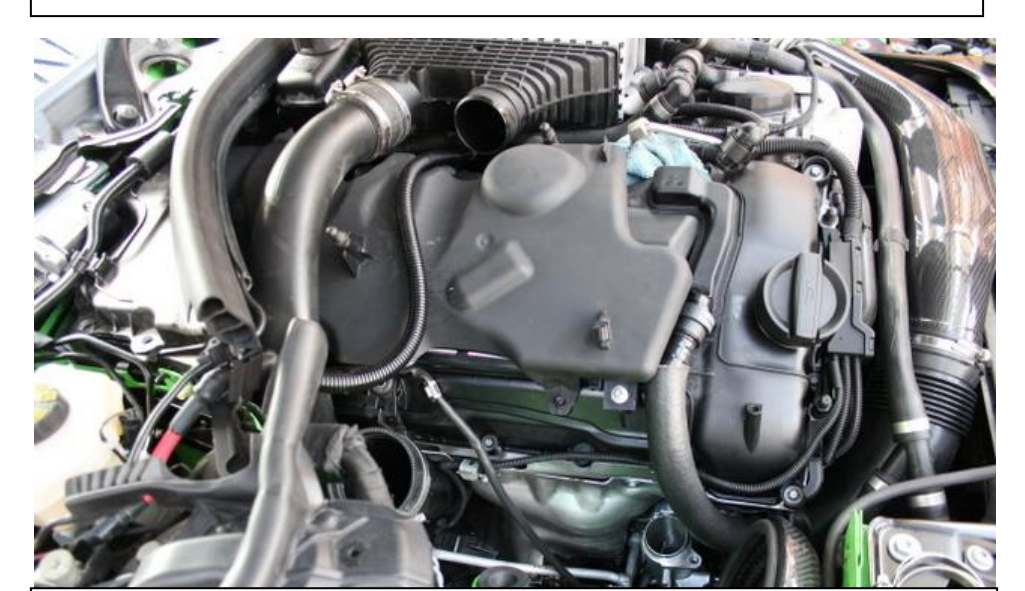
3. Remove the front chargepipe from the engine bay.

Start by loosening the hose clamps on the top side of the chargepipes.