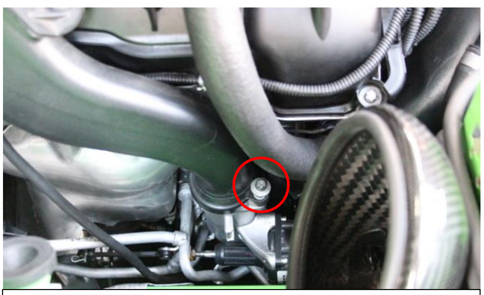
2. Remove the screw holding the front chargepipe on the turbo outlet pipe.