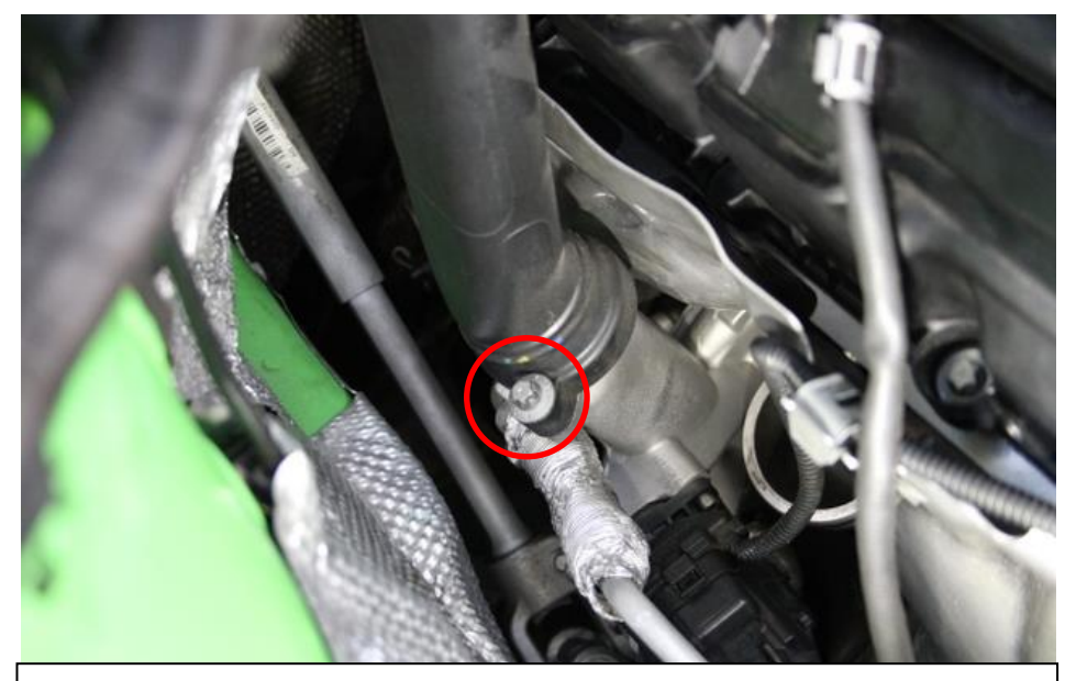
5. Now remove the screw holding the rear chargepipe in place and remove the chargepipe completely.