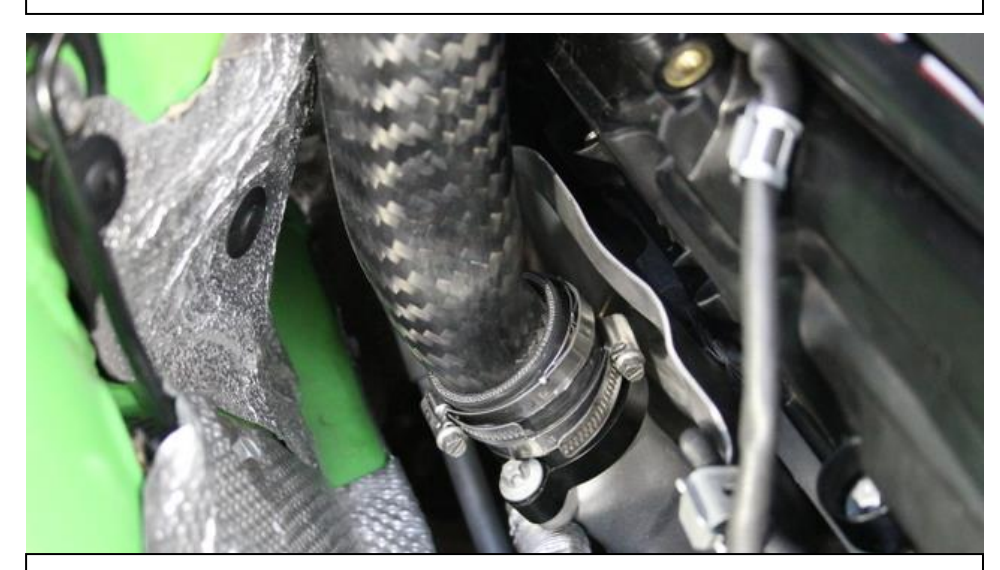
12. Push the chargepipes into the lower flanges first. Don't tighten yet.