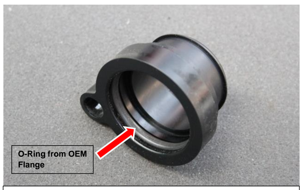
6. Remove the O-Rings inside the OEM chargepipe flanges and transfer them to the new Eventuri flanges.