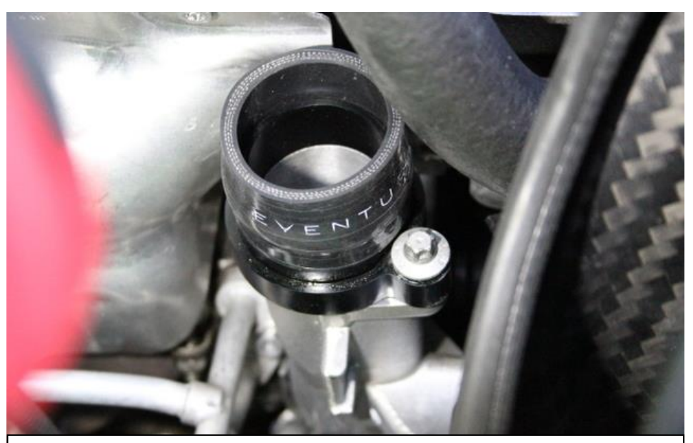
9. Push the smaller silicon couplers onto the flanges all the way down.