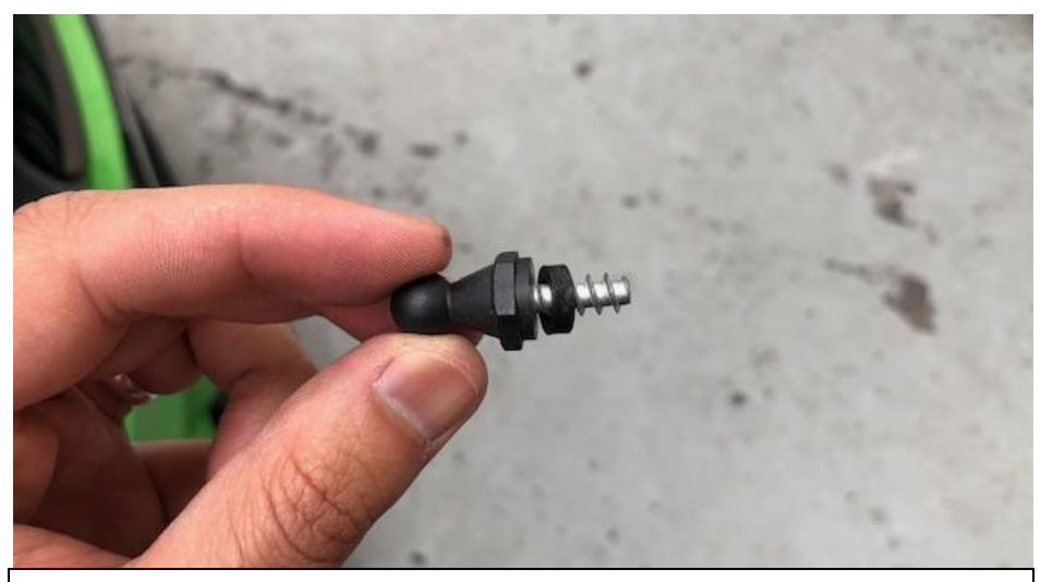
17. Use the provided plastic spacer washer and re-install it.