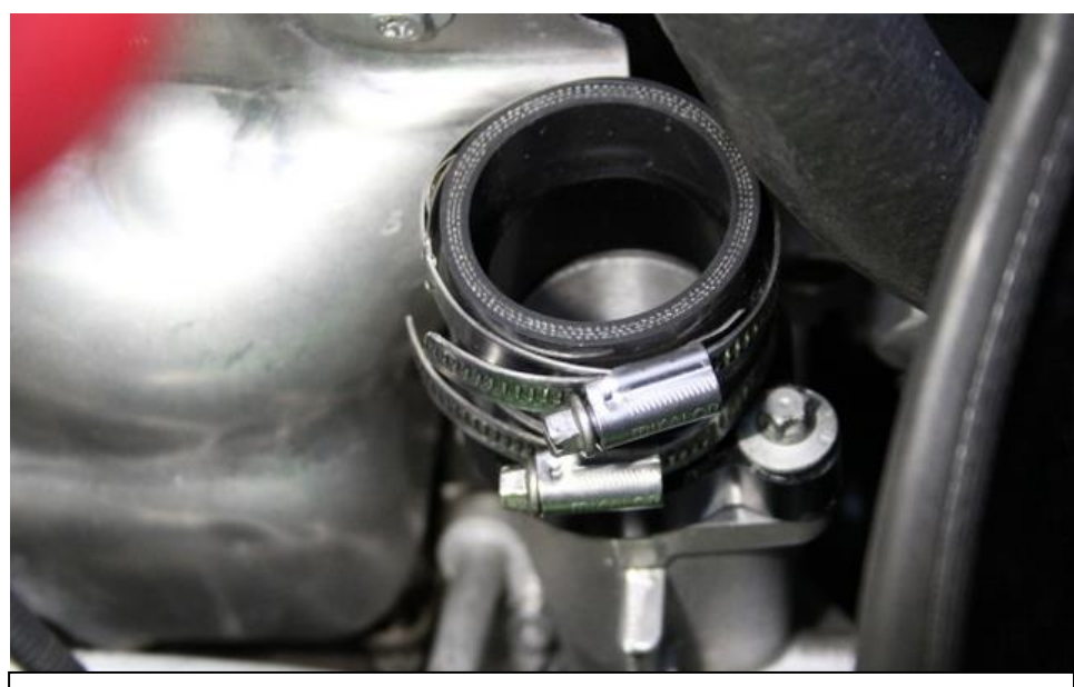
10. Install the smaller hose clamps (40-60mm) onto the silicons. Make sure the clamps do not interfere with the screw - face them away as shown. Tighten the clamps around the flange.