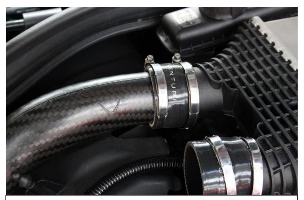
13. Now push into the upper silicons. For easier access you can loosen the charge cooler and lift it slightly.