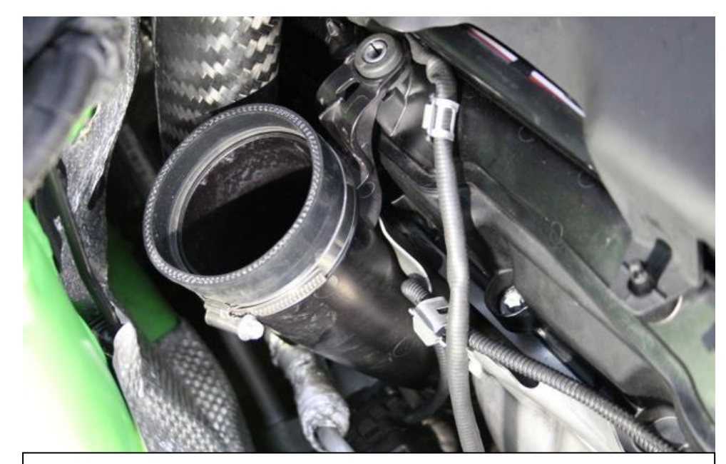
14. Install the turbo inlet tube again and secure with the OEM screw.