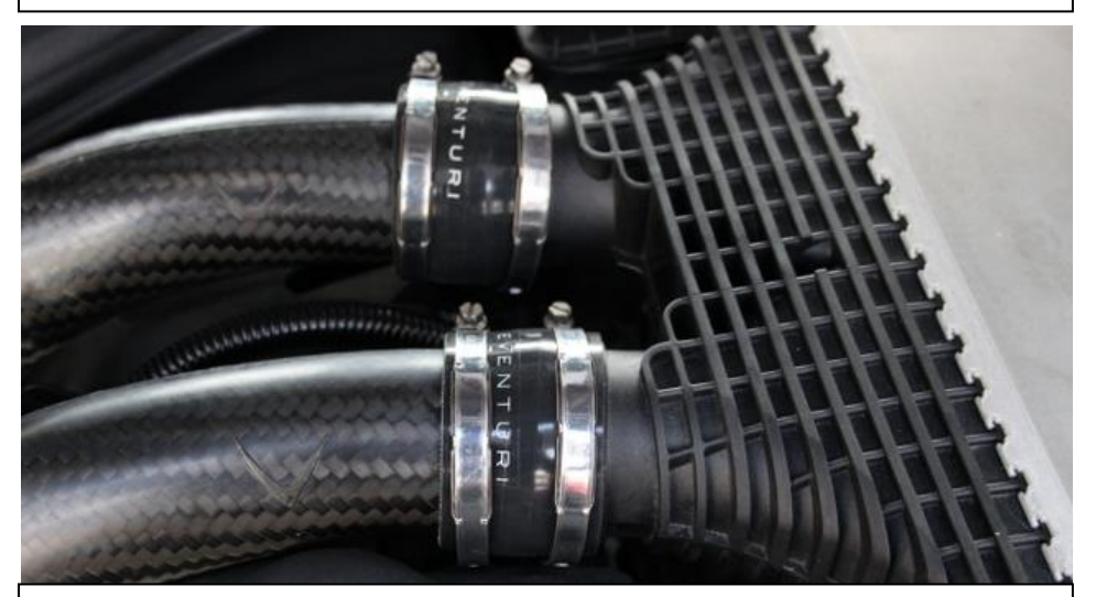
15. Install both chargepipes and tighten all clamps.