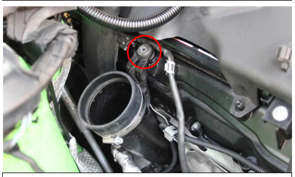
4. Remove the plastic turbo inlet pipe by removing the retaining screws and then pulling out the pipe.