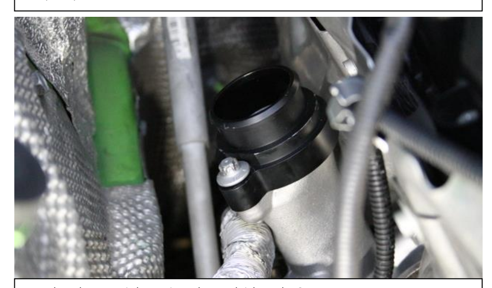
7. Push Both Eventuri Flanges into place and tighten the OEM screws.